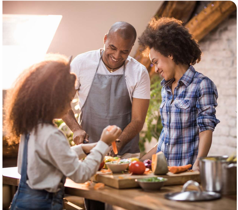
Improving your diet is one of the the many things you can do to avoid a heart attack.